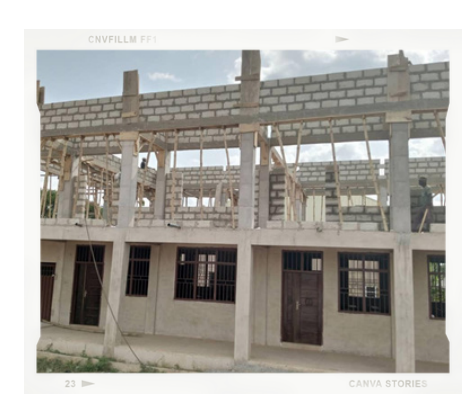
SPRING 2024 Students able to use first level of the building