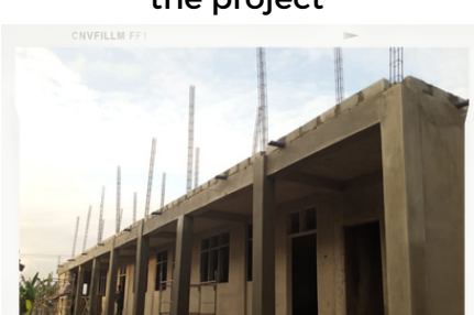
FALL 2023 Building construction continued post 2023 Gala