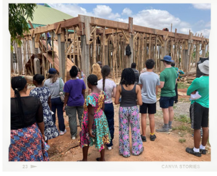
SPRINC 2023 Charlotte Country Day Students Visit the School