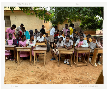
WHY WE BEGAN

Overcrowding and Classrooms Outside inspired the project